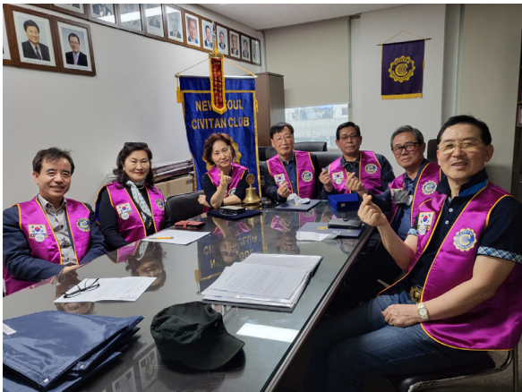
New Seoul Club in Korea meeting in April

Operating agreements are being offered to these clubs outside the United States to allow for them to be a part of the organization while being adaptable to adhere to their country's laws and cultural norms/traditions. They are not being offered to entities within the United States (although licensing agreements are being pursued with club and district foundations since they are not chartered through CI).