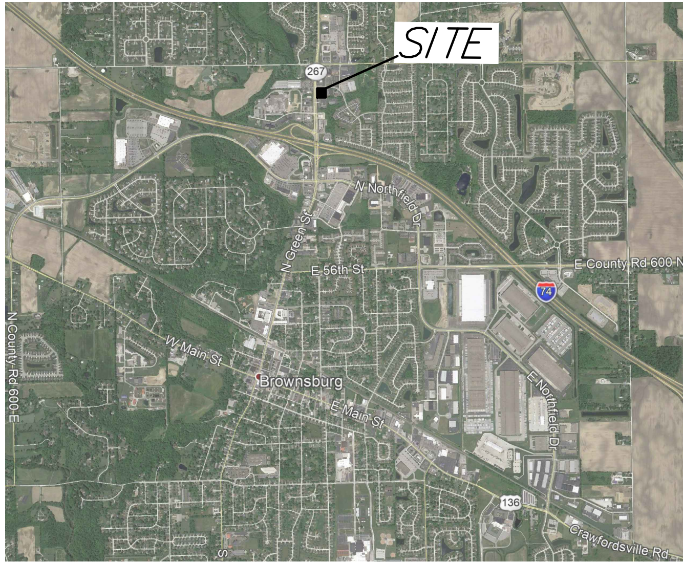
LOCATION PLAN NO SCALE